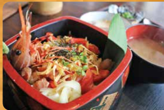
海鮮ちらしと 茶碗蒸し御膳 Chirashi Combo

assorted diced sashimi on sushi rice, & freshly made savory egg pudding