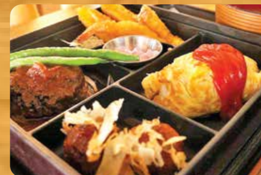
お子様弁当 Kid's Bento

rice patty w/ your choice of vegetable fries or half size of prawn & avocado salad $12 ($10)