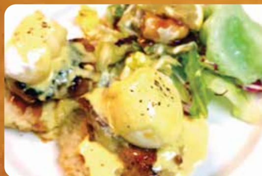
照り焼きチキン ベネディクト Teriyaki Chicken Egg Benedict

“haccho-miso” braised beef curry on rice w/ port cutlet $13.8 ($12) without pork cutlet $10 ($9)