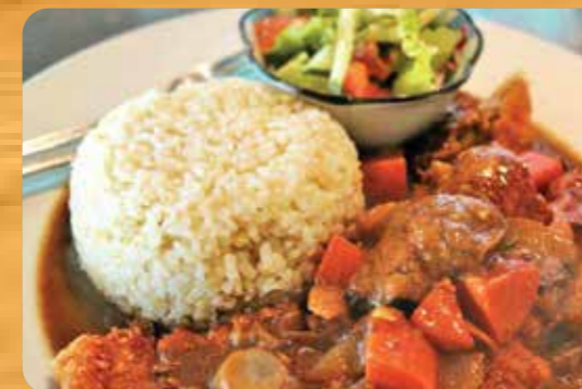
牛すじどて カツカレーライス Pork Cutlet Curry Rice

“haccho-miso” braised beef curry on rice w/ port cutlet $13.8 ($12) without pork cutlet $10 ($9)