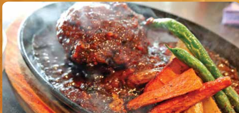
和牛ビーフハンバーグ Wagyu Beef Hamburg Steak

“edible in raw” quality hamburg steak Combo! Add Prawn & Avocado Salad, Bang Bang G Salad, or Ice Cream for $2