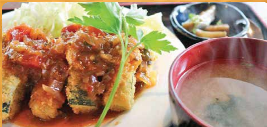
野菜のフライ トマトチリソース定食 Veggie Fries

rice patty w/ your choice of vegetable fries or half size of prawn & avocado salad $12 ($10)