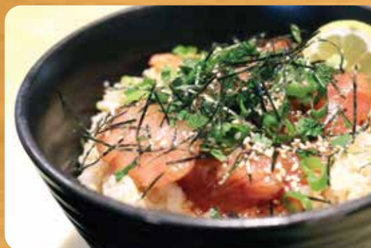
漬ナマグロとトロロ丼 Tuna Don

soy marinated tuna sashimi rice bowl w/ ground "yamaimo" & "nori" seaweed