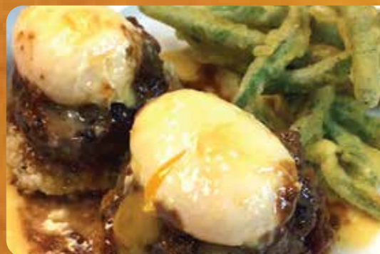
和牛ソーセージ ベネディクト Wagyu Beef Sausage Egg Benedict

“haccho-miso” braised beef curry udon topped w/ half boiled egg $10 ($9)