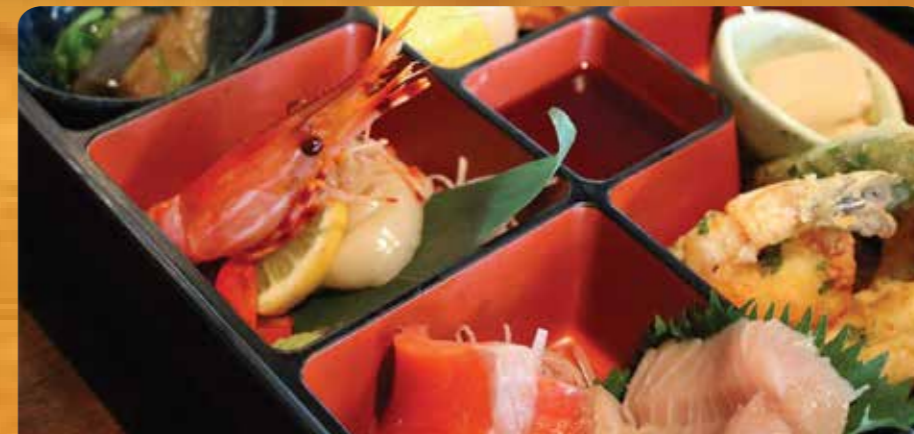
贅沢殿様弁当 Royal Bento Box

four kinds of sashimi, ebi-mayo, cauliflower karaage, ingen fries, & grilled fish of the day