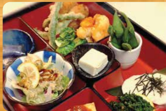
お野菜だけで姫君弁当 Vegetable Bento Box

cauliflower karaage, spicy fried tofu, ingen fries, edamame, goma-ae, yamaimo, pumpkin fries, wasabi avocado salad