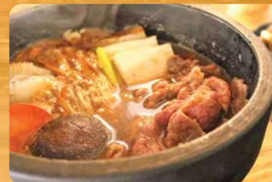
ポルチーニ隠し味 石焼すきやき定食 Sukiyaki Combo

sweet soy stewed beef, tofu, & veggies in a hot stone bowl combo