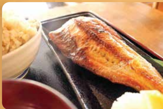
焼魚定食 Grilled Fish