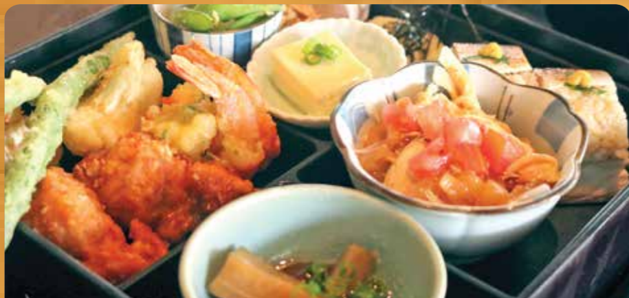
彩々よくばり定食 Izakaya Bento Box

chicken & cauliflower karaage, edamame, tuna tataki, ingen fries, ebi-mayo, bang bang G salad, & more!