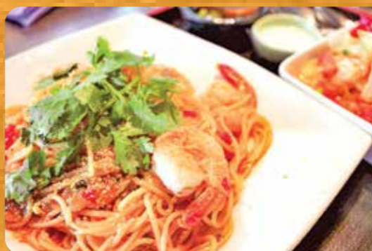
エビチリスパゲッティ 棒棒鶏サラダ Ebi-Chili Spaghetti

sweet & sour deep fried chicken w/ “shibazuke” tar tar sauce combo $12 ($10)