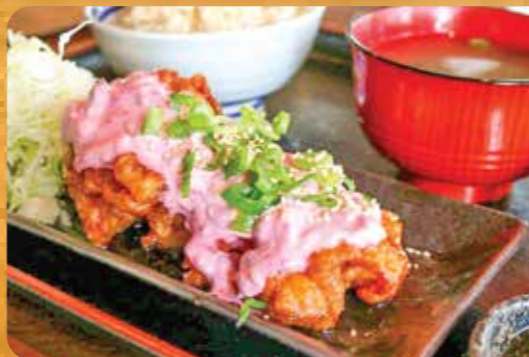
我殿チキン南蛮定食 Chicken “Nanban”

sweet & sour deep fried chicken w/ “shibazuke” tar tar sauce combo $12 ($10)