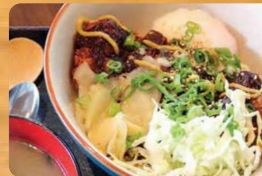
名古屋風 みそカツ丼 Miso Katsu Don

"haccho-miso" pork cutlet rice bowl w/ half boiled egg